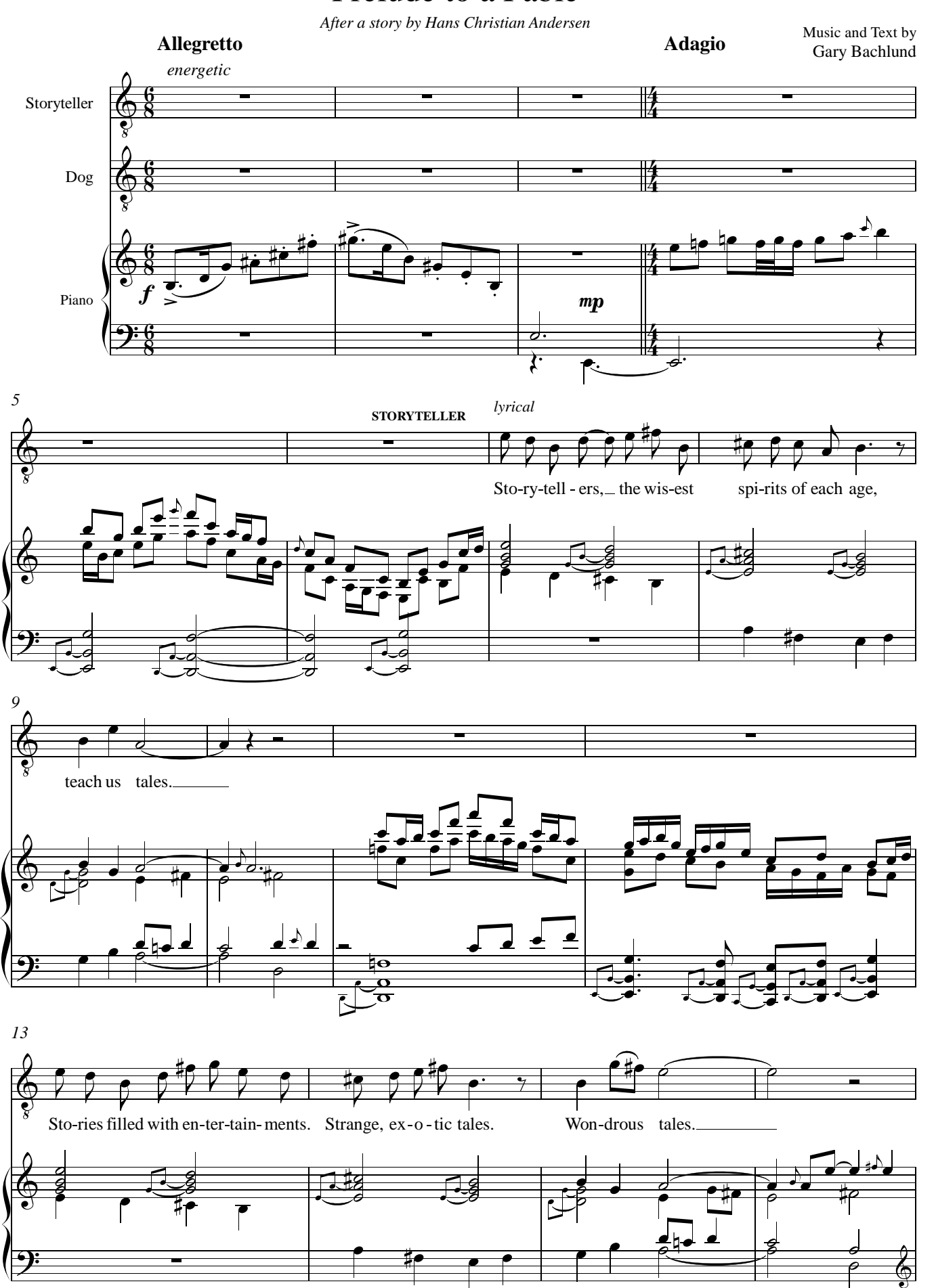
Copyright @ 1994 \ \ Gary \ Bachlund \ \ . \ All \ international \ rights \ reserved. \ \ www.bachlund.org